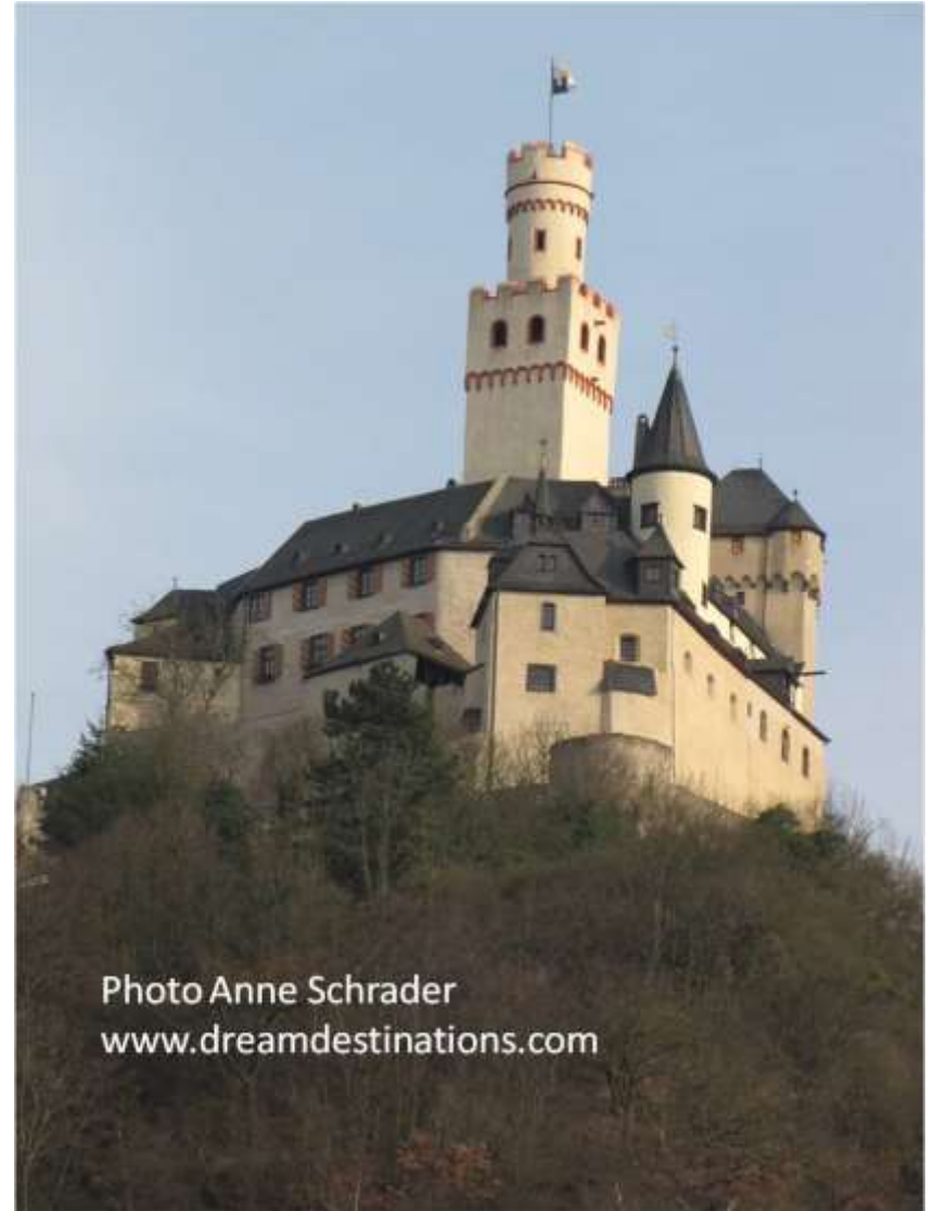
Marksburg Castle, Germany