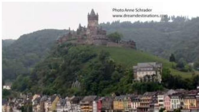
Reichsburg Castle Cochem, Germany