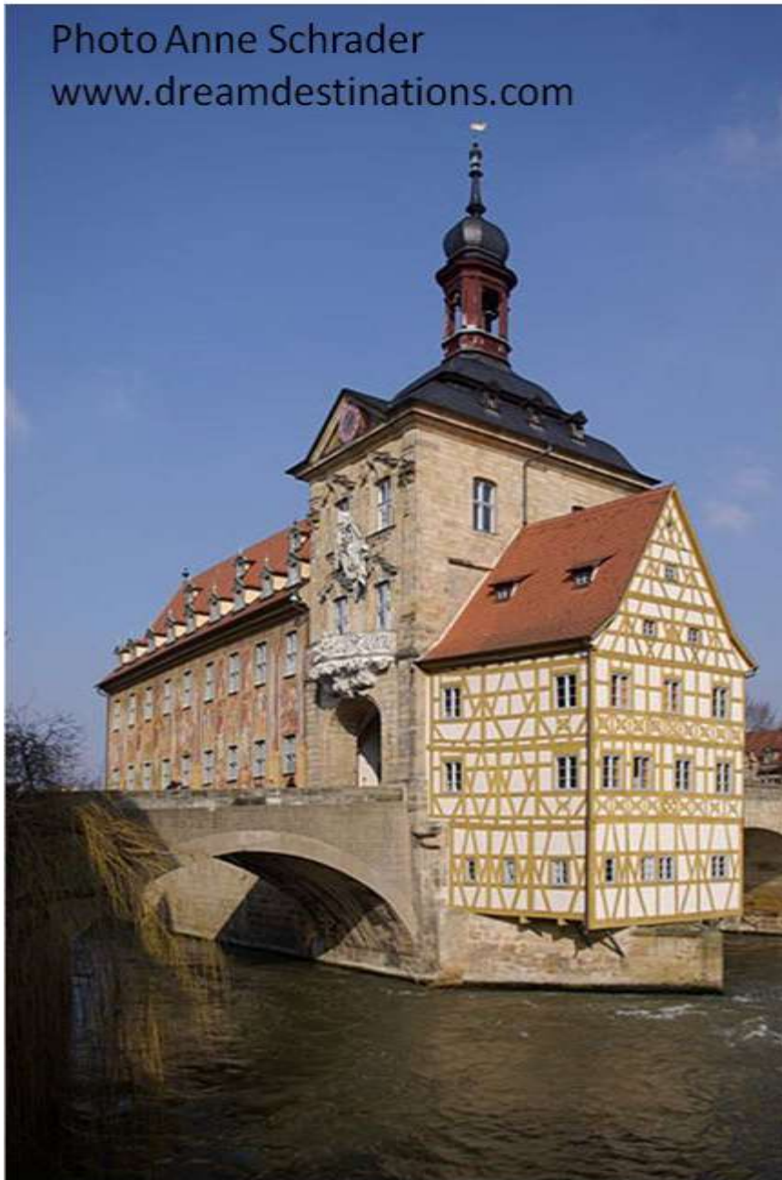
Bamberg Rathaus (town hall)