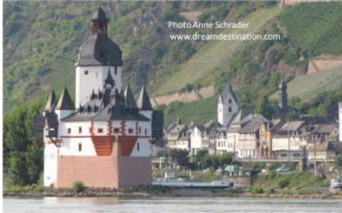
Pfatzgrafenstein Toll Station, Germany