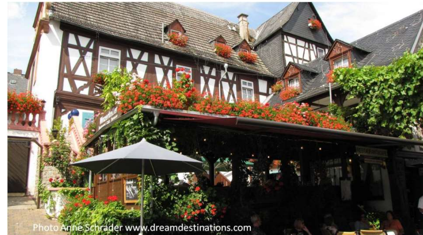
Rudesheim, Germany Wine Stubbe