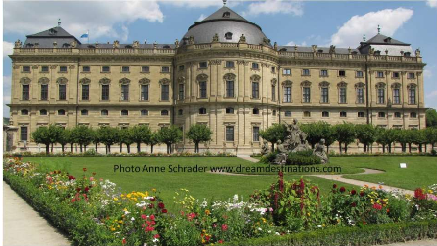
Residenz Palace Wurzburg , Germany