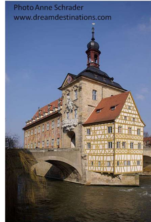
Town Hall Bamberg, Germany