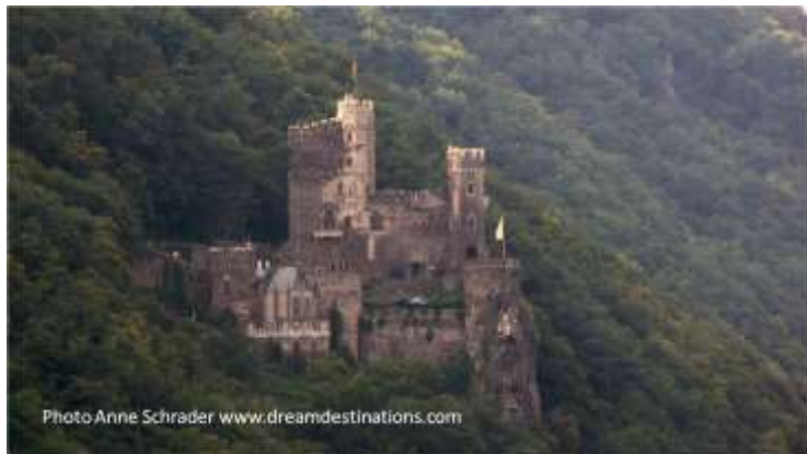
Rheinstein Castle, Rhine River Castles